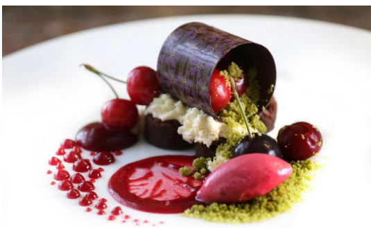
The Essence of the Black Forest | Dessert presentation, Food, Food presentation